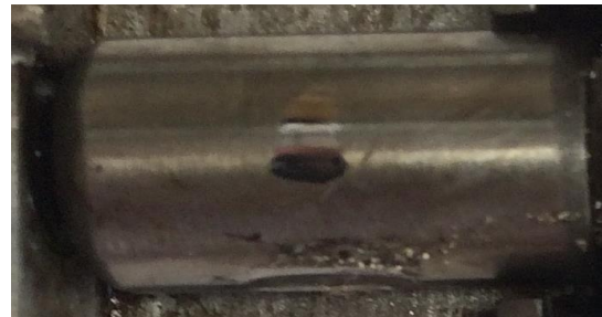
DrillTech at >650 psi