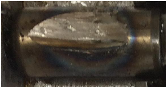
NaCl Brine at 100 psi