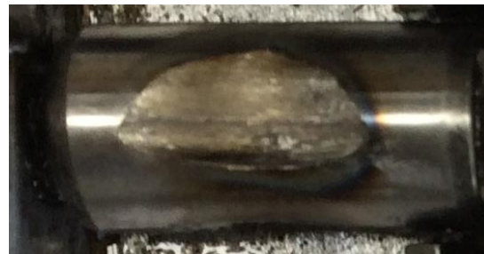
Lube 2 at 200 psi

Testing was performed in calcium chloride brine using the OFITE Lubricity and EP meter and the Timken Bearing tester.